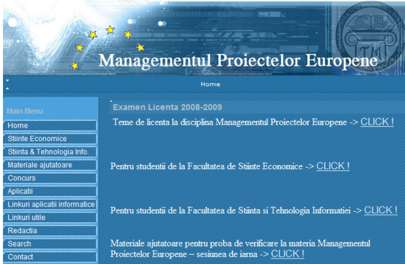
Figure no.2 The site for the subject of European Project Management within Titu Maiorescu University for the Faculties of Computer Science and Economic Sciences.

Five paradoxical situations accompanied Eminescu on his poetic path. 22 The first paradoxical situation is that Eminescu is the Romanian writer with the shortest literary activity: only thirteen genuine years. To these we can add the first four years, from 1866, the years of his literary debut in the magazine 'Familia' to 1870, the year of his debut in 'Convorbiri literare'. These were years of searching, reading great books, the establishment of the themes and the revelation of the specific style.