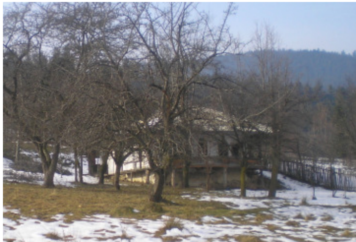
Figure no3 The house from the monastery of Varatec in which Eminescu lived